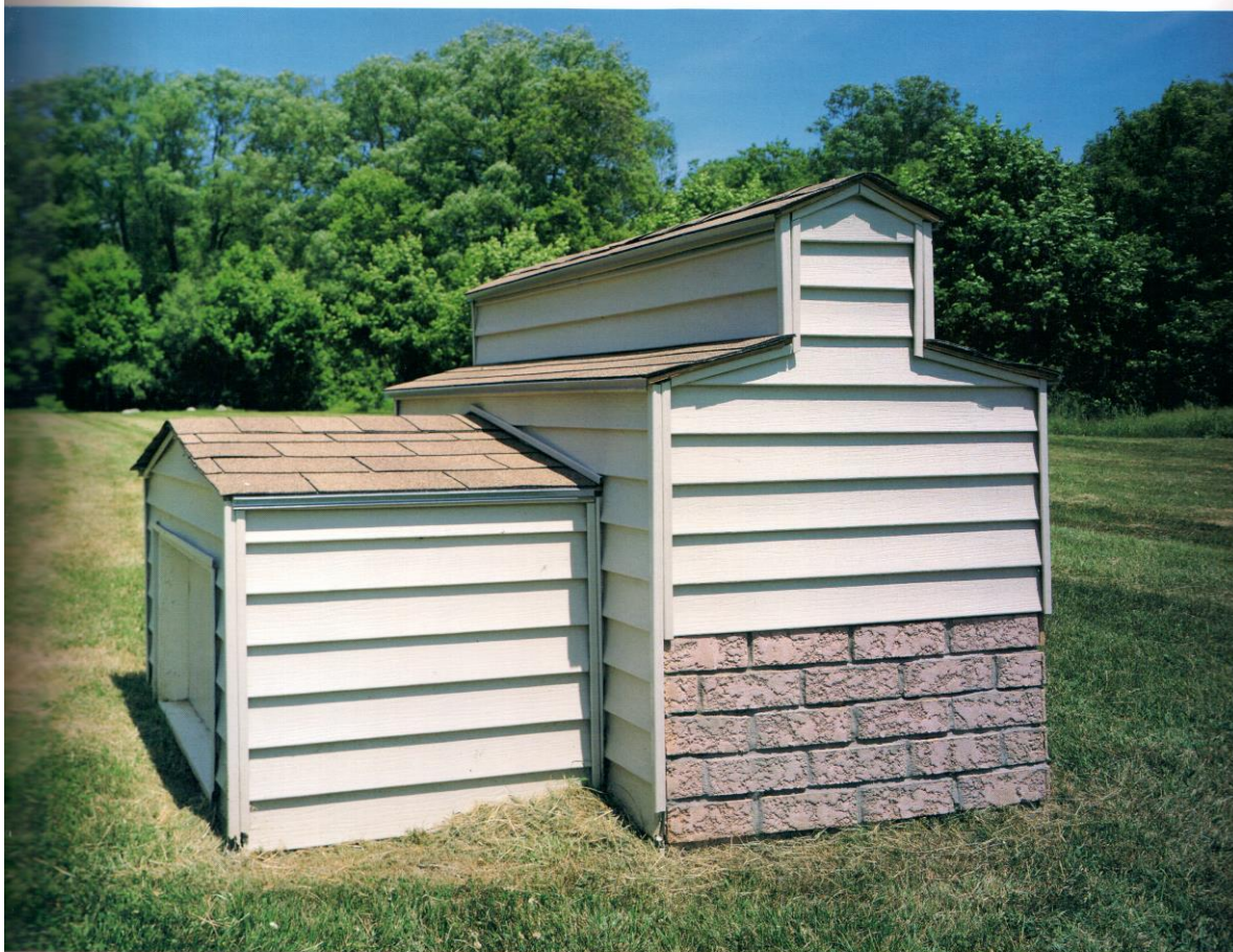
Gary Greenwood Home, 1998 construction materials 55 x 63 x 72 inches