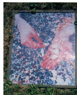
right Psyche's Inventory (detail)