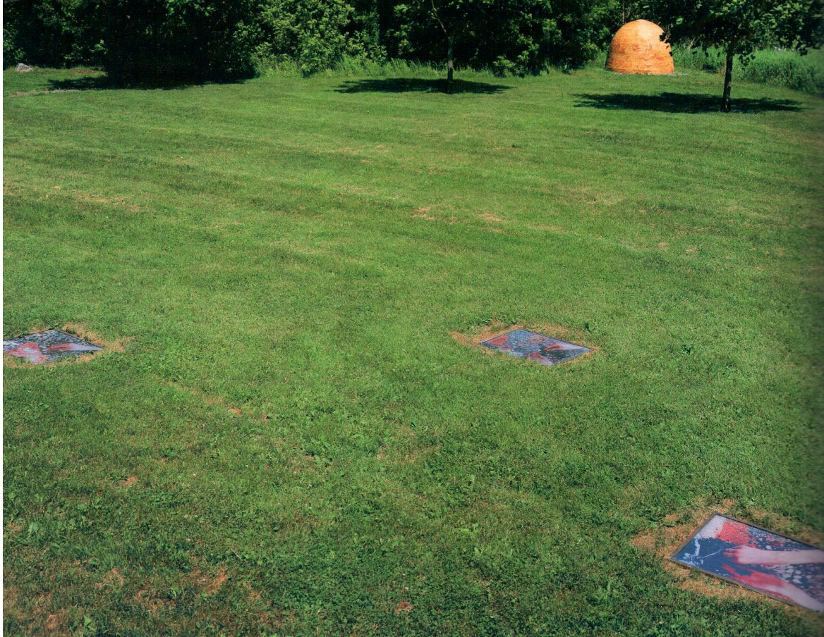
above Penelope Stewart Psyche's Inventory , 1998 three colour duratrans, three light boxes 33 x 25 inches each